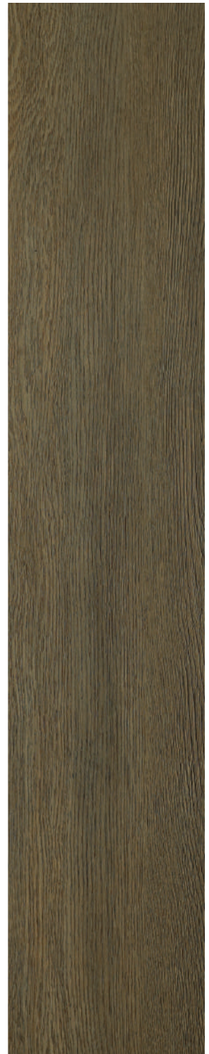
TM 04 * DUAL TONE SHADE