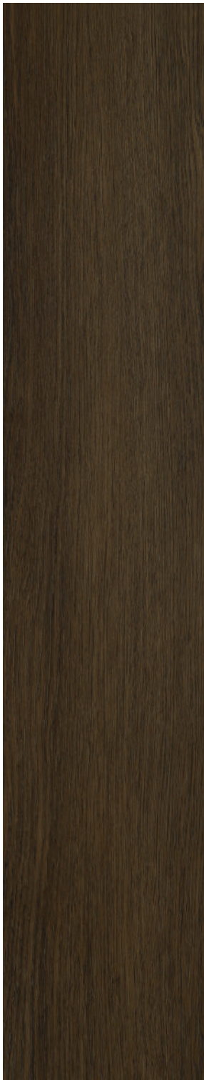
TM 05 * DUAL TONE SHADE