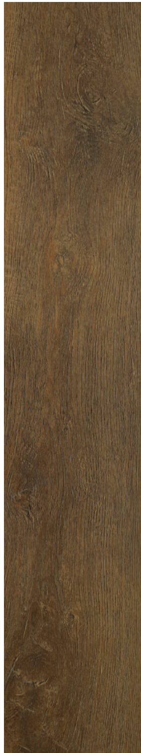
TM 03 * DUAL TONE SHADE