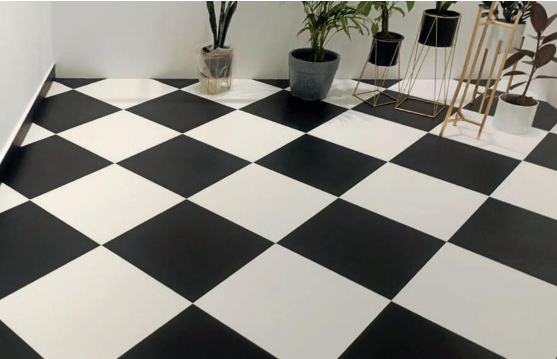
457.2 mm (18 inch)