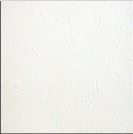
457.2 mm (18 inch)