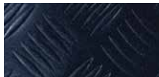
Sparkle Dk Grey