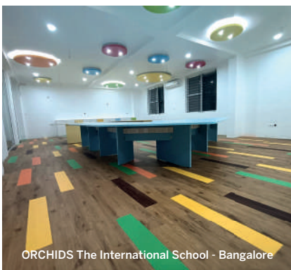
ORCHIDS The International School - Bangalore