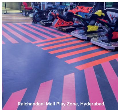
Raichandani Mall Play Zone, Hyderabad