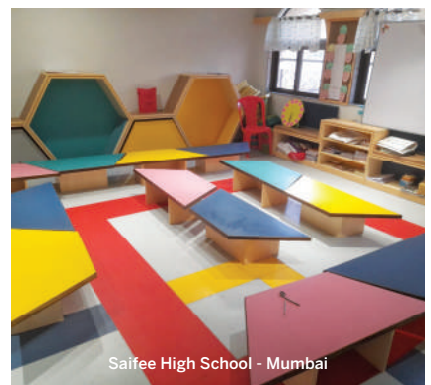
Saifee High School - Mumbai