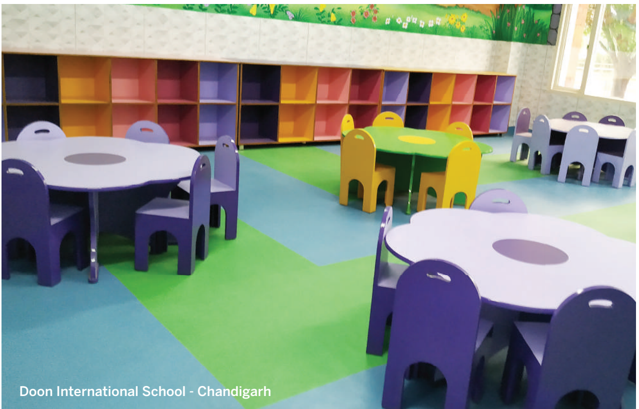
Doon International School - Chandigarh