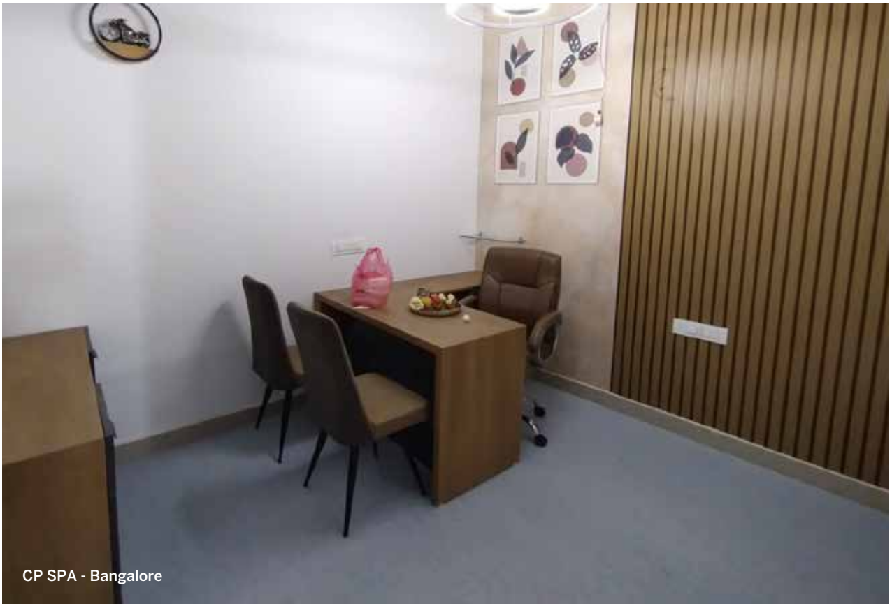
CP SPA - Bangalore