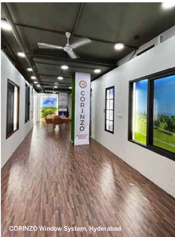
CORINZO Window System, Hyderabad